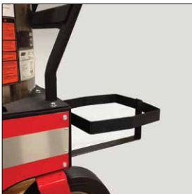
Optional Detergent Bucket Bracket