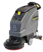
B 40 W WITH D 51 HEAD