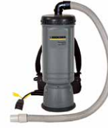
BV 7/1 VAC PAC 6 HEPA