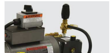
VRT3 with Bypass Loop