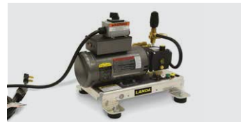
Modular Design shown with optional Skid Mount Feet