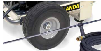
Flat Free Tires