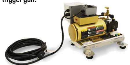
HD 1.8/1350 Ed equipped with Auto Start/Stop shown with optional skid mount feet