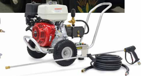
Direct-Drive HD Gas Cart with optional skid mount feet