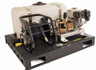
HD Direct Drive shown with optional HD Pallet Skid with Tank