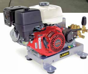
Belt-Drive HD Gas with optional skid mount feet