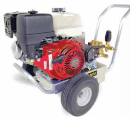
Belt-Drive HD Gas Cart