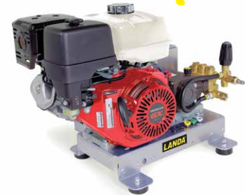
HD 4.0/40 GB shown with optional skid mount feet